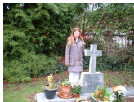
The Salesian Grave at St Michael's Blaisdon