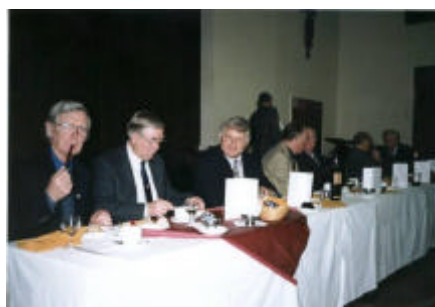
An excellent AGM and Annual Reunion Luncheon was held in the school dining room with invited guests from the SDB community, National Council and others. See photos of top table (above) and general tables (below).

Through the efforts of our Newsletter Editorial team we have started to compile an e-mail address list which again is an excellent medium for keeping in contact with the younger generations as they are pretty well all on the internet. We see this as very much the way forward.