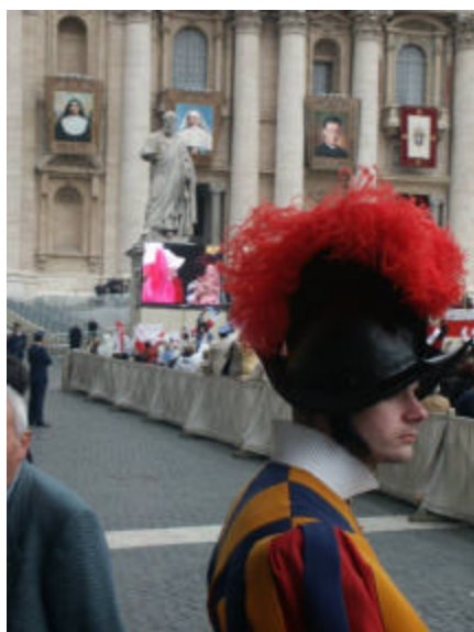
The Swiss guards were on duty