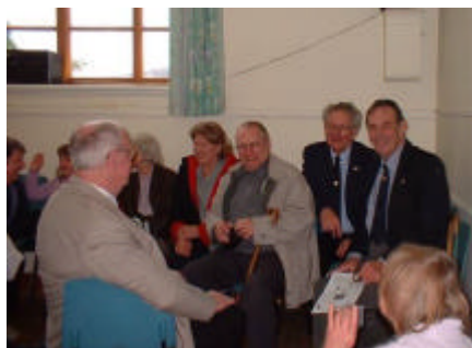
In Blaisdon Village Hall