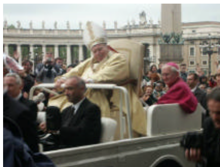
Pope John Paul arrives