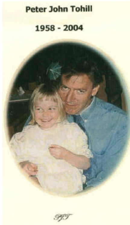
The cover of the beautiful Service Booklet