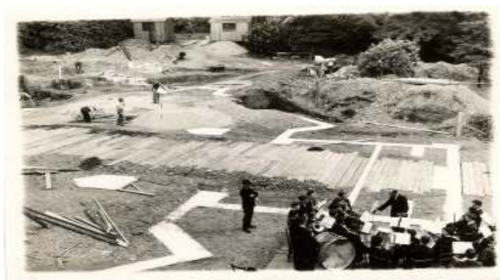
This may be the earliest picture of the laying of the foundations for the chapel